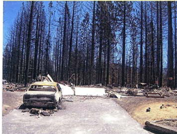
Angora Fire, South Lake Tahoe, 2007

Within our immediate area, the Lake Tahoe Basin experienced the Angora Fire which destroyed over 3100 acres, 309 structures and had a cost of $13 million to contain. There were other fires in the Tahoe-Truckee region that had the potential of being just as devastating. Firefighters battled the Washoe Fire near Homewood (West Shore) and were able to contain the fire at only 15 acres, but five homes were destroyed and it cost an estimated $25,000 to contain. The Town of Truckee experienced the Interchange Fire, which grew to 80 acres and cost $600,000 dollars to contain.