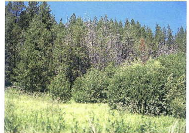
Example of overstocked forest.

Although we cannot control all of the contributing factors, we can control one particular factor--- overstocked forests . Today's California forests stand in sharp contrast to our historic forests. Historically, our forests were less dense and populated with fewer trees.